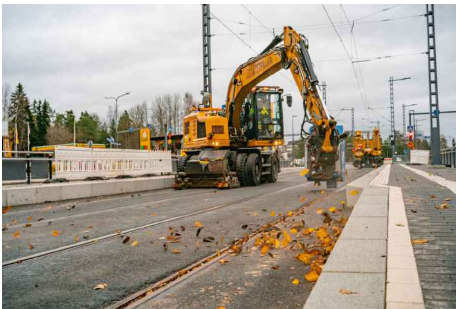
At the tramways of Tampere, the HRVB Hydraulic Recycling Vacuum Bucket is used for daily maintenance. The air-blowing ability is used for tramway cleaning.

But what about the air blowing applications? The air blow port is on the same side as the auxiliary vacuum port. Basically, the air is blowing through this port all the time when the bucket's fan is running. But if you want to use the bucket for air blowing you just need to flip the bucket with a rotator to another way around and you are ready to blow for example leaves, trash, and snow from your way. This application is in use at the tramway of Tampere, Finland as we speak.