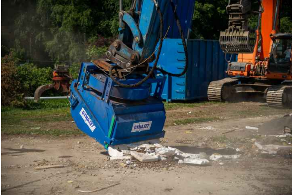
This new bucket can be used for worksite cleaning like a vacuum cleaner. Packaging plastics and such are often trying to spread to the environment because of the wind. With this bucket, daily environment cleaning is fast and possible.