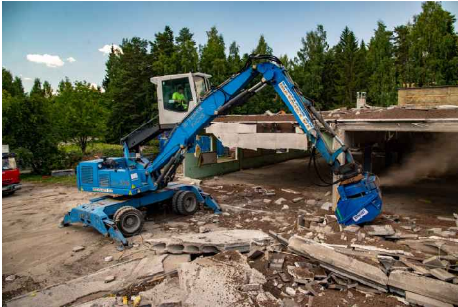
The first application of the Vacuum product category is the HRVB Hydraulic Recycling Vacuum Bucket. This bucket is a game-changer for waste sorting in the fields of property management, demolition, and construction.

January of 2021 is here, and it brings great news to the field of machinery! We launch a new product category called Vacuum. The products of this category are specified to airflow and they can be used for vacuum and for air blow applications. The products of this category get their operating power from hydraulics as all our products do.