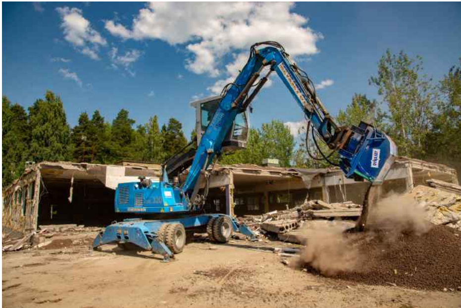
With HRVB Hydraulic Recycling Vacuum Bucket it is possible to sort demolition waste better which is a more cost-effective way to do site cleaning. For example, light expanded clay aggregate, or LECA, can be sorted out from the rubble or directly from the structures when LECA is exposed.

With this bucket, it is fast to collect any types of wool, plastics, pieces of wood, and light expanded clay aggregate (LECA). It is even possible to collect specific materials during the demolition work. For example, the bucket can be used for collecting the wool from the structures right when they are exposed during the demolition. That way wool can be sorted before it ends up in rubble piles.